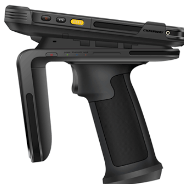
UHF Sled Reader